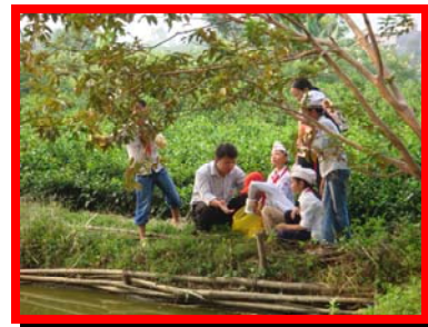
Collecting water samples

For CWS Vietnam, Information – Education – Communication (IEC) has become an annual activity within its projects in order to raise awareness and encourage increased hygienic behavior of local communities at its project sites. This year, the program was organized on October 13 th , 2007 in the Phuc Thuan Primary School No 1, Pho Yen district, Thai Nguyen province as part of the "Community Water System and Education Development" project to participate in the World Water Monitoring Day™, an international education and outreach program that builds public awareness and involvement to protect water resources around the world. With easy-to-use test kits, more than 250 school teachers and students had a chance for the first time to conduct basic monitoring of their local water bodies for a core set of water quality parameters including temperature, acidity (pH), clarity (turbidity) and dissolved oxygen (DO), along with other designed fun activities.