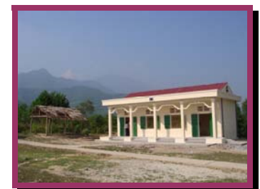
Kindergarten in Dam Ban

Following a needs assessment in July 2007 with participation of commune leaders, school representatives and CWS staff at the Dam Ban village, where ethnic minority people make up 85% of the village population, a design of 2 separate buildings of 4 classrooms for village primary school and kindergarten have been made to meet the demand of students for the 2007-2008 school year. In November, the schools with new classrooms and with ramps on both sides of the stairs to encourage and for the convenience of disabled children going to school, and other necessary teaching and learning aids such as tables and chairs for students and teachers, boards, bookshelves, educational toys, etc. were put in operation to help make the school environment more accessible, friendly, safe and attractive to the students.