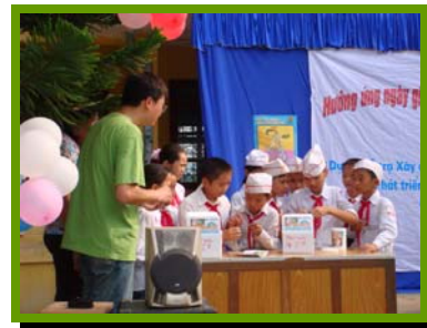
Testing of the water