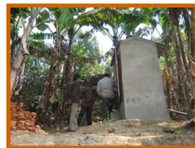
Inspection of a new latrine

During 2006-2007, a total of 70 household latrines were built in the villages of Bum Nua commune. The evaluation of the latrine construction was conducted by the project management unit of the district Health Department in order to assess the activity results, initial impacts, as well as to plan for the expansion of this activity to include more households, villages and communes. The results of the evaluation have been shared in a workshop with participation of relevant project stakeholders. In this workshop, a small network of village IEC collaborators was set up in the first 5 villages in Bum Nua commune for the promotion of construction of latrines for the households as well as for promotion of personal and environmental hygiene practices.